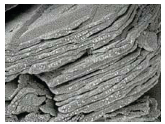
Figure 3: Nanoparticles of three calcium aluminate (3CaO, Al<sub>2</sub>O<sub>3</sub>)

best solution would be to use bundles of sufficiently long nanotubes with no other material added. For this reason, one of the dreams of nanotube production is to be able to spin them, like thread, to indefinite lengths.