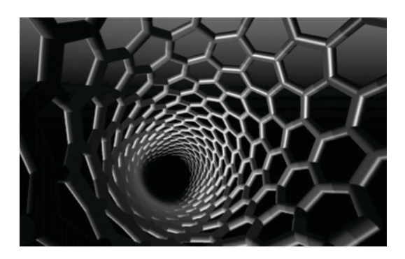
Figure 1: A single-walled carbon nanofibers

or on nanoparticles, sometimes in predetermined positions. These processes vary considerably with respect to the type of produced nanotube, quality, purity and scalability. Carbon nanotubes are usually created with the aid of a metal catalyst and this ends up as a contaminant with respect to many potential applications. IBM has very recently, however, grown nanotubes on silicon structures without a metal catalyst [Cientifica 2004].