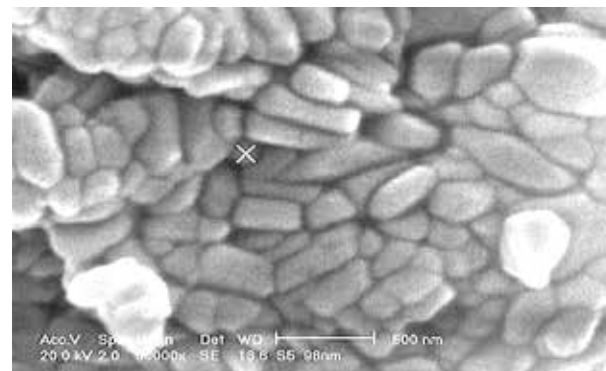
Figure 4: SEM image of the synthesized nanocrystallite KTP doped by 3% Nd.

The SEM images of the synthesized nanocrystallites showed that the grains of the powders were almost needle-shaped, Figure 4. In comparison with pure KTP nanocrystallite sample which has a round shape, doping caused change in the overall shape, but by considering the related XRD pattern, the orthorhombic crystal structure was survived. Determining the grain sizes of the synthesized nanocrystallite by SEM imaging technique faced with huge uncertainty. The sizes of the grains also were calculated by Debye-Scherrer equation, [10], using the XRD patterns and were found to be in the ranges of 12-70 nm which was different from the SEM imaging results.